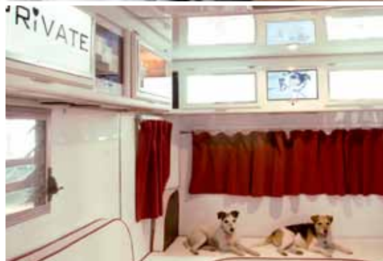
The TMU, deployed. The Archway, DUMBO, Brooklyn, 04 August 2011 (top)

B: Our original plan for the TMU was to tow it cross-country, making art along the way and filming a documentary of our travels. Our destination would be an art exhibition somewhere on the west coast, where we would show the paintings that Tillie created en route. We currently intend to bring the Unit to a few locations between now and the end of the year, culminating in a visit to Art Basel Miami in December. We will set off for the west coast in Spring 2012... unless we decide to tour Europe first. #